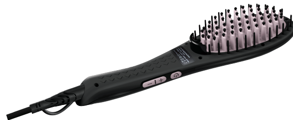
Ceramic Shine Straightener brush Sleek Solon Performance

READ ALL INSTRUCTIONS BEFORE USING.KEEP AWAY FROM WATER.